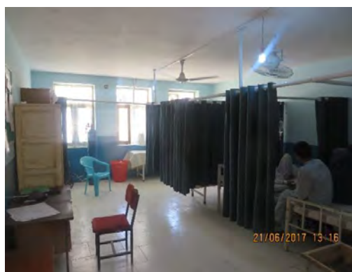
Photo 6 - Andkhoy Clinic Patient Room