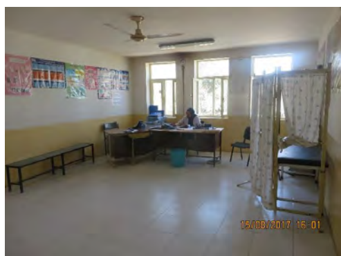
Photo 3 - Women's Doctors' Office at Qaisar Clinic

According to the director, patients are occasionally turned away or referred to another facility for treatment due to the lack of staff, equipment, and medicines.