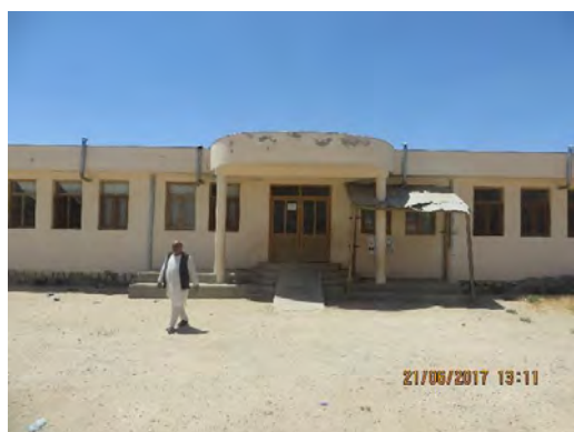
Photo 5 - Andkhoy Clinic Exterior

The Andkhoy clinic was completed in March 2010, at an estimated cost of $236,895. 15 When we visited the Andkhoy clinic in June 2017, we found it was open, in usable condition, and had access to clean water, and that most windows and doors were intact. However, we also found that the roof was leaking, which, if left unrepaired, could lead to other structural problems. 16 According to a doctor we spoke with at the clinic, the clinic did not have enough medicine or medical staff, particularly female medical staff, to provide treatment for the 400 patients that visit the clinic for treatment on a normal day.