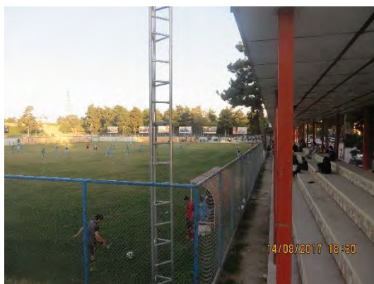
Photo 10 - Park Soccer Field