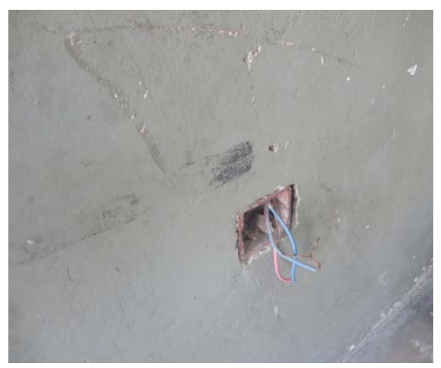
Photos 4 and 5 - Exposed Wires and Missing Bulbs at School S325A and SR 120

to electricity in the classrooms or offices. Of these schools, however, only three schools had functioning lights due to faulty wiring, and broken bulbs. Photos 4 and 5 show one of the common issues, exposed wiring and missing bulbs, at two of the schools.