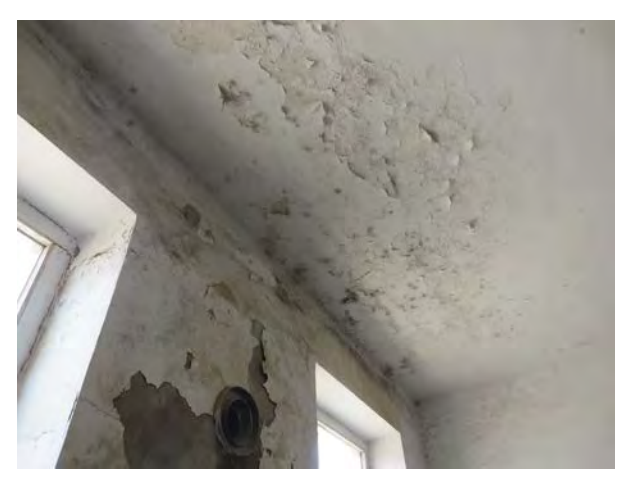
Photos 8 and 9 - Ceiling and Structural Damage at School S326A and SR 200

During our site visits, we observed schools with minor structural deficiencies, including some deficiencies that potentially put the safety of students and teachers at risk. Specifically, we found five schools with roofs that leaked and two with broken windows. We also found that three schools had damaged walls, while seven schools had damaged doors. Photos 8 and 9 show water leakage and ceiling damage in two of the schools.