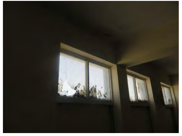
Photos 10 and 11 - Broken windows and doors at Schools SR 120 and SR 102