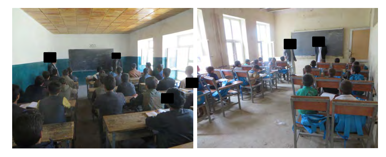
Photos 1 and 2 - Students in Well-Attended Classes at Schools SR102 and SR108