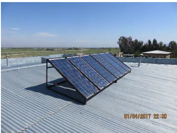
Photo 1 - Solar Panels at Facility 866