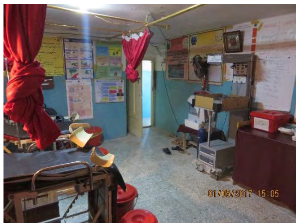
Photo 4 - Small Maternal Ward at Facility 1621