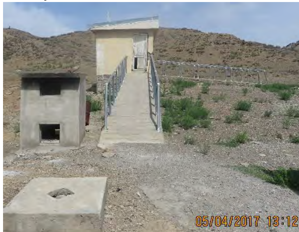
Photo 6 - Accessible Open-air Kiln at Facility 2234