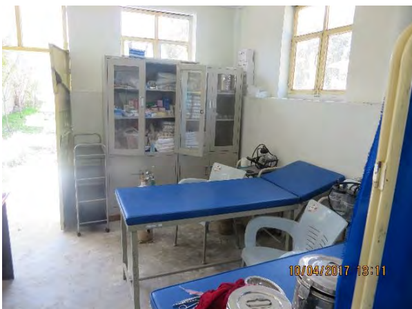
Photo 3 - Treatment room at Facility 870