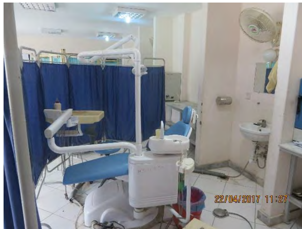
Photo 2 - Dentistry Wing at Facility 682