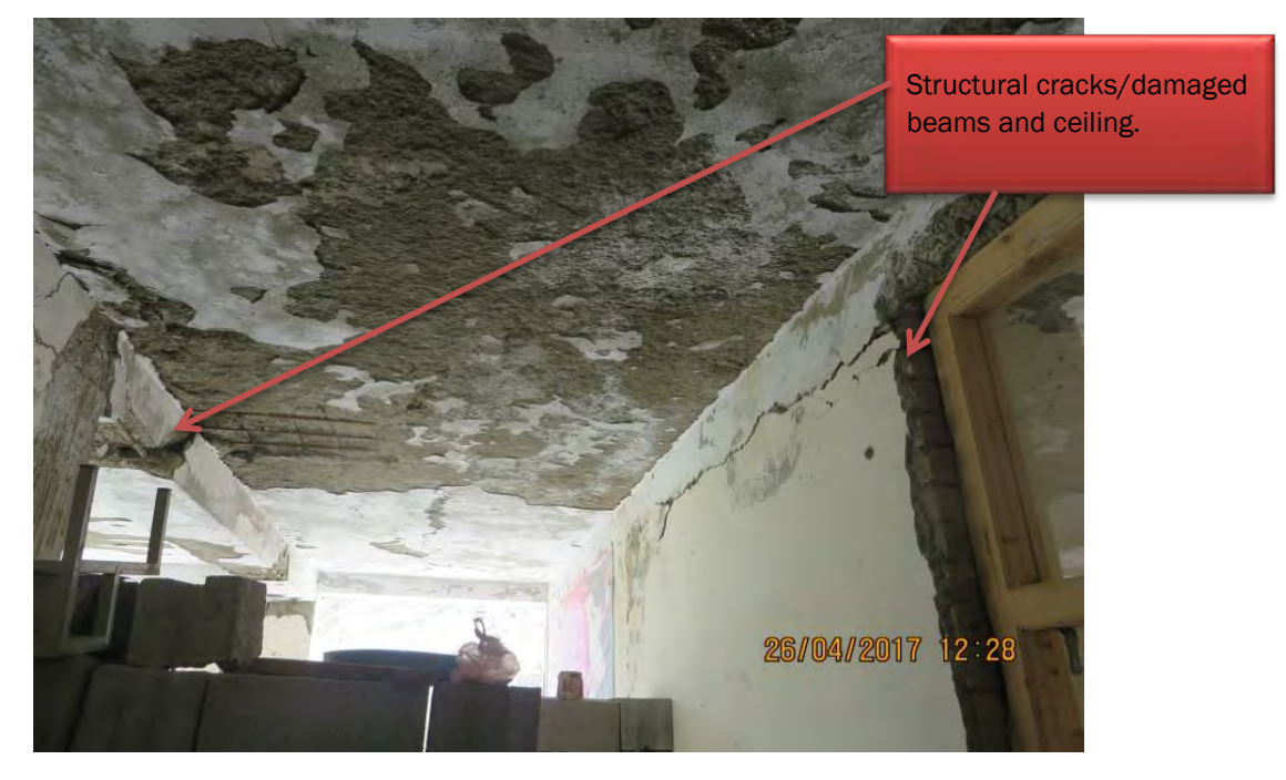
Photo 4: Structural Damage to Roof Beam and Ceiling at Health Facility 2132