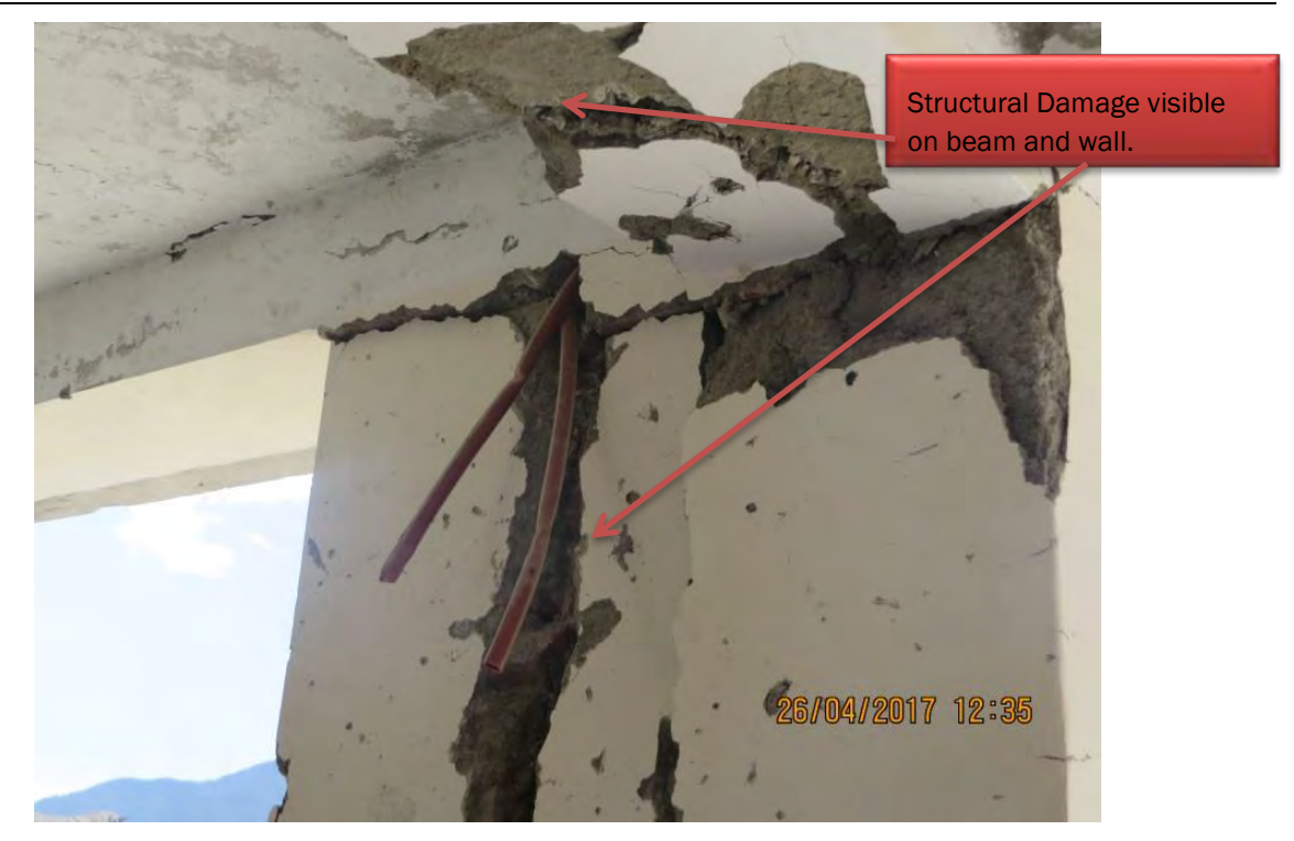
Photo 3: Structural Damage to Support Beam and Wall at Health Facility 2132