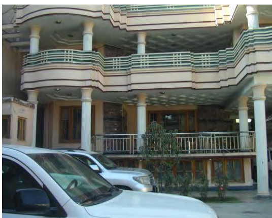
Figure 1 - TFBSO Villa in Kabul

Similarly, over this period, MNBE provided “TFBSO Government staff, Contractor staff and guests with full life support services while in country, to include but not be limited to, secure accommodations (outfitted at a 3-star equivalent level or better), secure low profile transportation . . . VOIP [Voice Over Internet Protocol] communications capabilities, on-site laundry service, on-site food & meal service (with light snacks and water/tea/coffee/sodas available 24 hrs.), business office space to include all equipment necessary to conduct business operations (computers, printers, phones, scanners, desks and chairs), housekeeping, maintenance, grounds and cultural advisors and translators.” 17 Figures 1 and 2 show the TFBSO “villas” in Kabul.