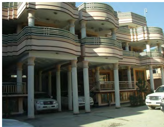
Figure 2 - TFBSO Villa in Kabul