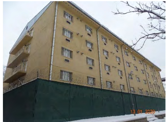
Source: SIGAR, January 13, 2020

All of the contract and task order files we reviewed for this audit referred to the 29 projects as being constructed under DOD's Women's Participation Program. Both DOD and ourselves have reported on the Women's Participation Program since at least 2016 and define the program as