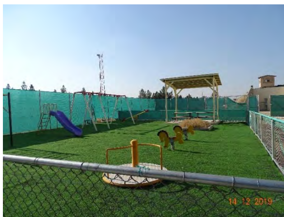
Source: SIGAR, December 14, 2019