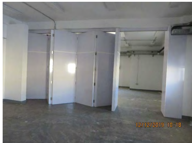
Photo 3 - Empty Building at the Gardez Regional Training Center

A senior MOI official in the Human Rights, Child Rights, and Gender Department stated that the women's police compounds at the Jalalabad Regional Training Center and the newly