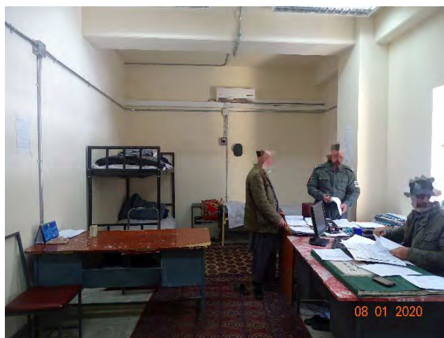
Photo 6 - Male Police Using Women's Facilities at the Panjshir Police Headquarters

In another example, USACE's contractor, Assist Consultants Incorporated, constructed a two-story building at the Panjshir Police headquarters, costing approximately $895,000, to be used as a female barracks and childcare center. During our site visit, we did not observe any female police at the site. However, a facilities department officer at the site stated that female police used the rooms on the first floor, intended for the childcare center, as changing rooms. We also found that the first-floor rooms were not equipped for childcare and the facilities department office stated no children were enrolled. In addition, MOI auditors were using the building's second floor as administrative offices along with male police officers (see photo 6).