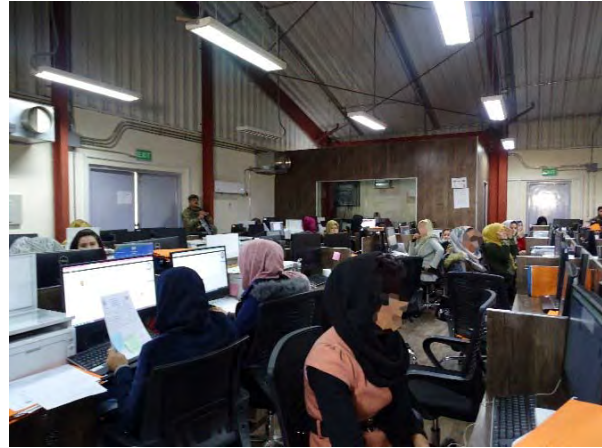
Photo 7 - Women Working at the MOI Headquarters Conference Center Building

We observed more activity at the MOI headquarters women's compound in December 2019 than when we visited the site in 2017, including use of the conference center as a workspace to update electronic payroll records (see photo 7). 36 According to MOI staff at the site, 10 of the 28 barracks rooms were used to support the site's Family Response Unit, and 3 rooms were reserved for emergencies. In addition, senior Afghan National Police officials at the site told us that 87 children were enrolled at the childcare center. We observed at least 20 children in the childcare center during our visit. Further, a kitchen stove that was not working during our 2017 site visit, was operational during our December 2019 visit, and staff was using it to prepare hot food for the children. Although the childcare center and approximately a third of the barracks were used, the majority of the barracks were not used and about half of them lacked furniture. Similarly, the fitness center lacked equipment and was not used.