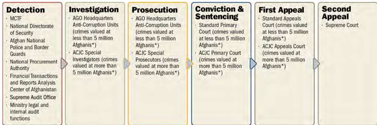
Figure 1 - Corruption Prosecution Chain