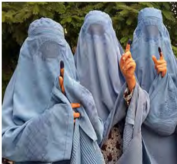
Women showing inked fingers after voting in Herat, June 14, 2014.

Officials from all three agencies reported that although the number of projects, programs, and initiatives specifically intended to benefit Afghan women will be consolidated after 2014, their efforts to support Afghan women will continue and, in some cases, the funding for these efforts will increase. However, the lack of agency-level assessments of the impact of these efforts to date, combined with ongoing challenges to implementing efforts to support Afghan women and with the U.S. government's expected reduced visibility over activities, will make it difficult for agency leaders and the Congress to understand and make decisions on future programs and funding in support of Afghan women.