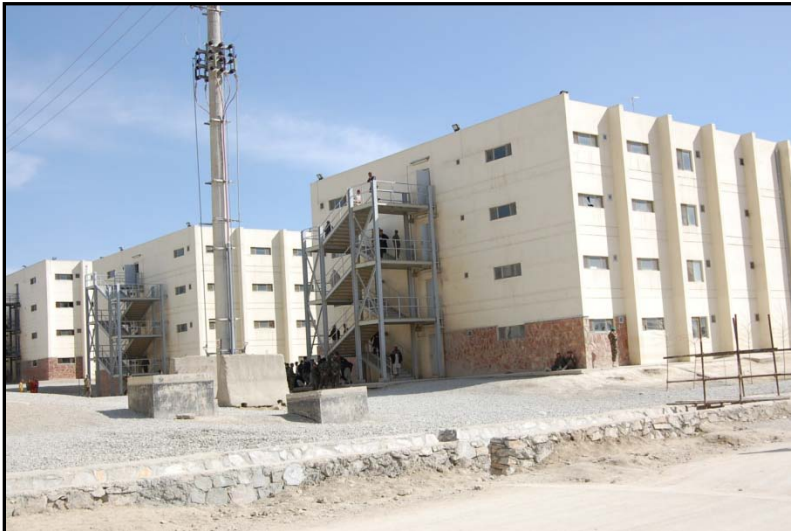
Photo 1: KMTC Phases I and II Completed Construction of Barracks Buildings

Photos 1 and 2 show some of the KMTC facilities.