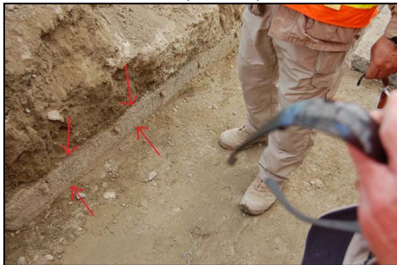
Photo 5: KMTC Phase III Construction – Previously Unknown Buried Soviet-era Foundation (see arrows)

ECC, the construction contractor for Phase III, also found previously unknown features in conducting detailed site surveys, including large buried foundations (see photo 5) and power lines that had to be relocated. Consequently, both AMEC and ECC experienced schedule delays.