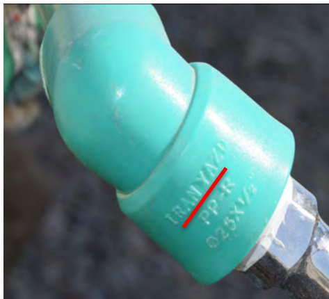
Photo 2 - Prohibited Piping from YAZD Pipe

YAZD Pipe, an Iranian firm, manufactured the green piping in these photos. Our visual inspection confirmed approximately 66 feet of above ground piping was Iranian. 5 Because Iran is subject to U.S. economic sanctions, the purchase and installation of the YAZD piping appears to have violated contract requirements and the Federal Acquisition Regulation. 6 During a December 2020 meeting, we brought this issue to USAID’s attention so the agency could determine appropriate corrective actions. 7