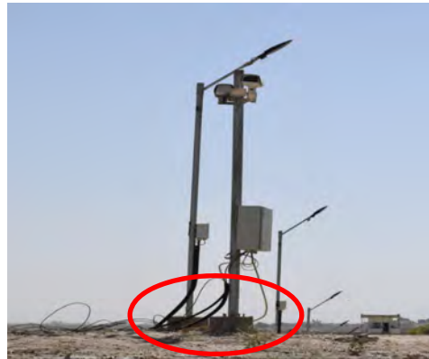
Photo 5 - Exposed Wiring Surrounding Pole Bases