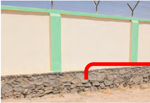
Photo 10 - Boundary Wall and Foundation