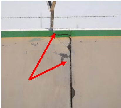
Photo 8 - Cracks in Boundary Wall

During our site visit, we found three maintenance issues at the solar power plant. Specifically, we found that 17 of the 36 security cameras (47 percent) were nonfunctional. We also found cracks in facility's boundary wall and on the roof of the control building (see photos 8 and 9). Further, we found mortar missing from stones that form the boundary wall's foundation (see photos 10 and 11). These were not identified during the project's final inspection in December 2019. While they do not affect the solar power plant's ability to operate as intended and produce electricity, the issues indicate Dynasty's difficulty in properly maintaining the plant.