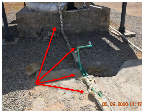
Photo 3 - Site Visit Photo With Prohibited Piping