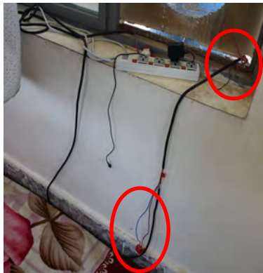
Photo 6 - Interior Exposed Spliced Wiring in Guard Tower