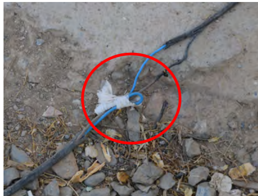
Photo 7 - Exterior Exposed Spliced Wiring from the Solar Panel Providing Power to the Guard Tower