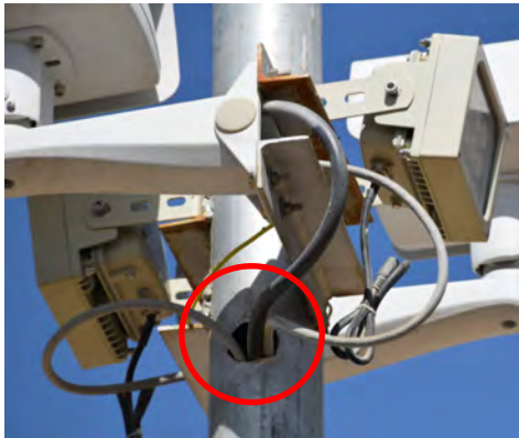
Photo 4 - Unsealed Opening in Pole

The power purchase agreement requires that Dynasty's construction and equipment installation meet applicable International Electrotechnical Commission standards. 8 These standards call for all electrical connections to be sealed so that wiring is not exposed to various weather conditions. During our site visit, we found multiple instances where Dynasty's electrical workmanship was substandard. Specifically, Dynasty did not seal openings where wire entered poles. We also found exposed wiring or splices at the exterior of some lighting and security camera poles, and in and around some guard towers (see photos 4 through 7). Although these issues do not affect the plant's ability to produce electricity, the deficiencies leave exposed wires susceptible to environmental deterioration or damage. In the guard towers the exposed wiring and connections present a safety and fire hazard to personnel working there.