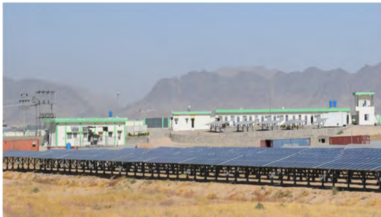
Photo 1 - Kandahar Solar Power Plant

On August 26, 2017, USAID issued Dynasty a notice to proceed with a required completion date of August 26, 2018. USAID and Dynasty modified the contract six times, which changed the construction completion date to December 29, 2019. Dynasty completed facility testing and on September 28, 2019, the solar power plant became commercially operational. 3 Dynasty was responsible for the design and construction, and it accepted ownership and responsibility for operating and maintaining the plant following construction. Therefore, the contract did not include a warranty on completed construction work, an item typically included in USAID-funded construction contracts in Afghanistan. 4