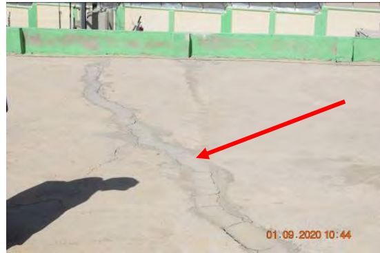
Photo 9 - Cracks in the Control Building's Roof