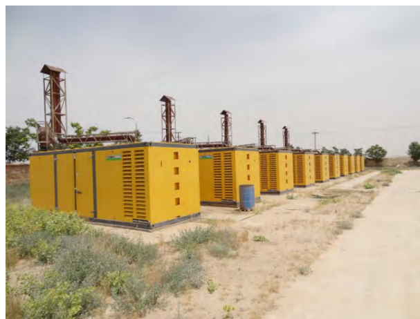
Photo 2 - Unused USAID-funded Generators at Gorimar Industrial Park