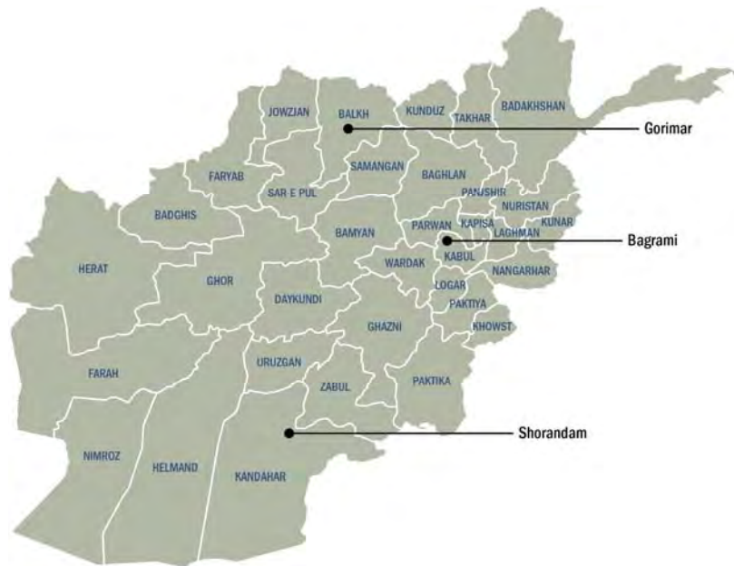
Figure 1 - Location of the Three Industrial Parks

TI's initial contract called for it to oversee solicitations and bids for the design, construction, and maintenance of the industrial parks. However, a subsequent contract modification—modification three—called for TI to complete the infrastructure for Gorimar Industrial Park, rather than to simply oversee solicitations and bids. The infrastructure at the industrial park included (1) a power plant and electrical distribution system, (2) a water supply system, (3) a sewer system, (4) paved roads, (5) a communications system, and (6) flood channels. Afghan officials stated that Gorimar Industrial Park contains 22 spaces for investors and entrepreneurs, to provide them with a secure location and the necessary infrastructure to develop their businesses and create jobs.