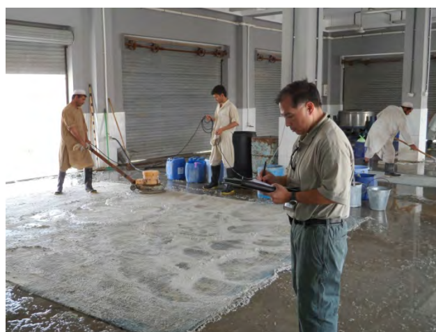
Photo 3 - Carpets Being Cleaned at the Carpet Cutting and Washing Facility