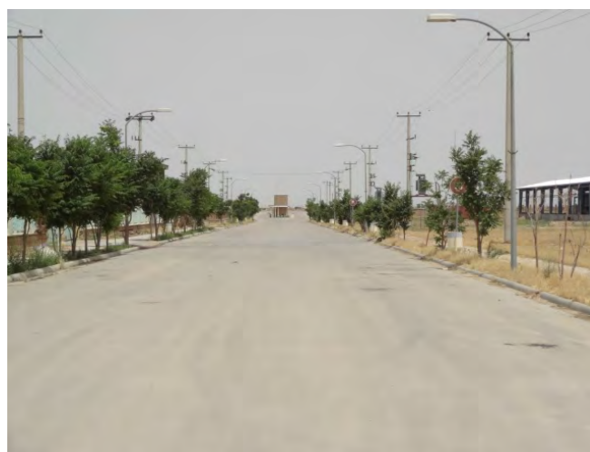
Photo 1 - Paved Entrance to Gorimar Industrial Park

Although we observed all of the major infrastructure components, we were not able to fully assess whether construction met contract requirements and technical specifications due to missing USAID contract files. Our inspections normally include the review of project design, planning, construction, quality assurance, and related documents. When we requested these documents, USAID officials were not able to provide them and could not explain their inability to locate and provide the contract documents. Federal Acquisition Regulation Subpart 4.8, "Government Contract Files," states that for construction contracts above $2,000, agencies are required to retain contract documentation for 6 years and 3 months after final payment. With respect to Gorimar Industrial Park, records of payment, including the record of final payment, were among the missing USAID contract files. However, USAID did provide us with an e-mail message stating that final outstanding invoices were still unpaid on March 17, 2010. This suggests that, per the Federal Acquisition Regulation, USAID was required to retain contract documentation for Gorimar Industrial Park until at least June 17, 2016. According to USAID officials, "task orders" were issued from the initial contract that cited specific work the contractor was responsible for;