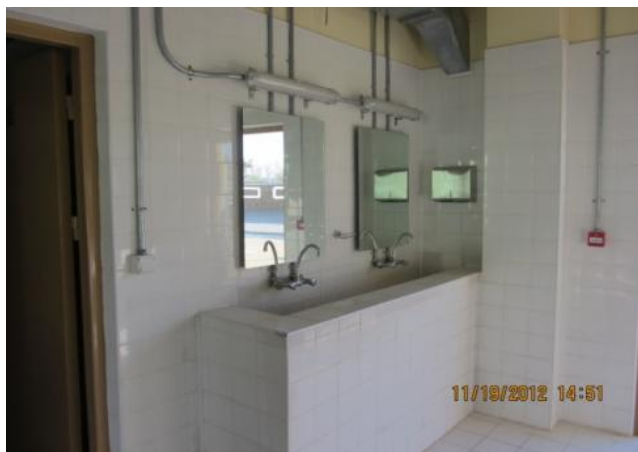
Figure 5 - Sinks in the Combination Latrine, Shower, Ablution, and Laundry Building