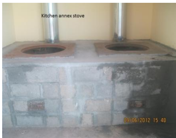
Figure 7 - September 6, 2012, Photograph of Two Installed Wood-Burning Stoves