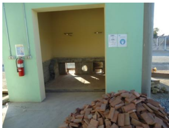
Figure 8 - November 19, 2012, Photograph of Dismantled Stoves