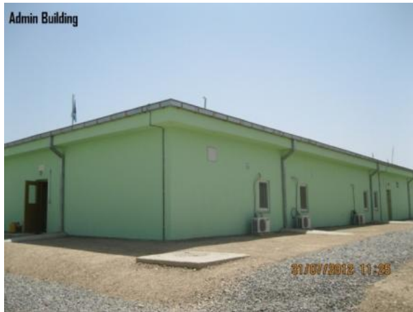
Figure 3 - Exterior of the Administration Building

Source: Courtesy USACE-TAN, July 31, 2012.