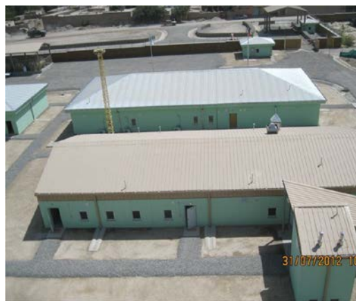
Figure 2 - Southern Portion of Imam Sahib Border Police Company Headquarters