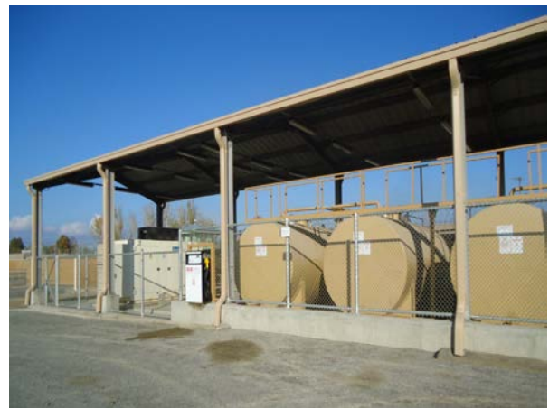
Figure 6 - Combined Fueling Point for Afghan Border Police Vehicles and Site Generator