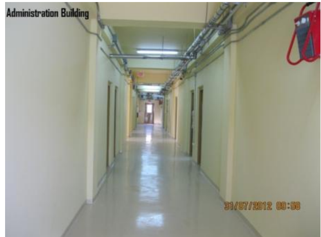
Figure 4 - Interior of the Administration Building