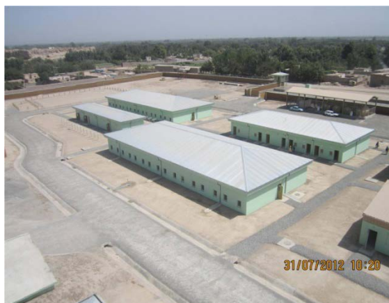
Figure 1 - Northern Portion of Imam Sahib Border Police Company Headquarters

See figures 1 and 2 for aerial views of the site that were taken by USACE-TAN in July 2012. Appendix III summarizes the scope of the contract.