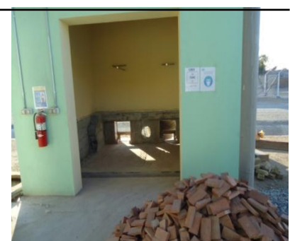
Wood burning stoves installed on September 6, 2012 (left photo), but dismantled (right) by the time of the SIGAR visit on November 19, 2012.