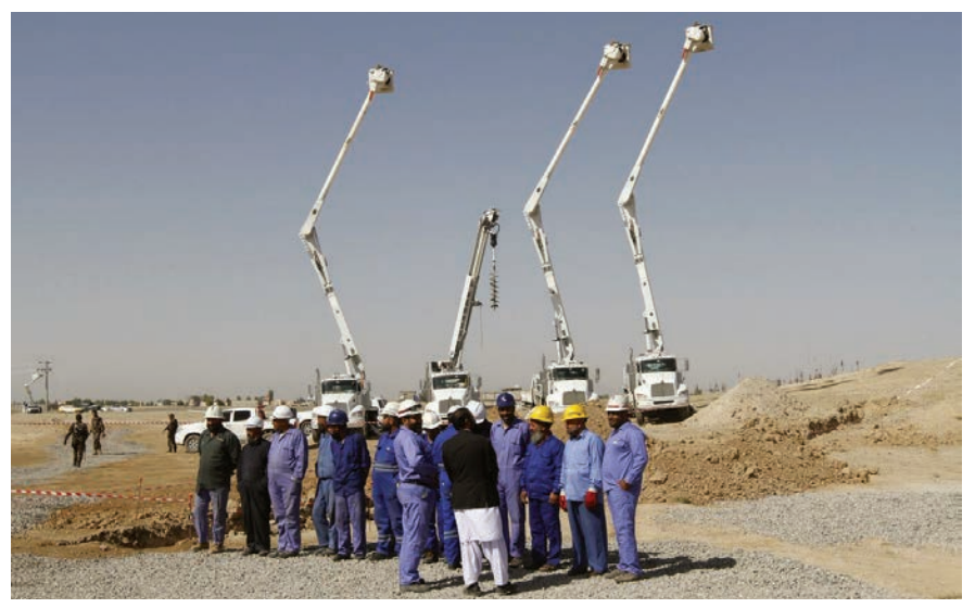
USAID broke ground on its 10 MW solar power plant project in Kandahar on September 24, 2017.

this quarter that the project was significantly delayed. USAID's contract with Dynasty was modified to extend the period of performance by one year to August 26, 2019, from the original completion date of August 26, 2018. The USAID said the delay was due to land-encumbrance issues encountered at the beginning of the activity as well as an issue with the customs-duty exemption for materials imported through Karachi, Pakistan. According to USAID, the land-encumbrance issues included the need to relocate public properties located on the site and to adjust to a new site location established by DABS.