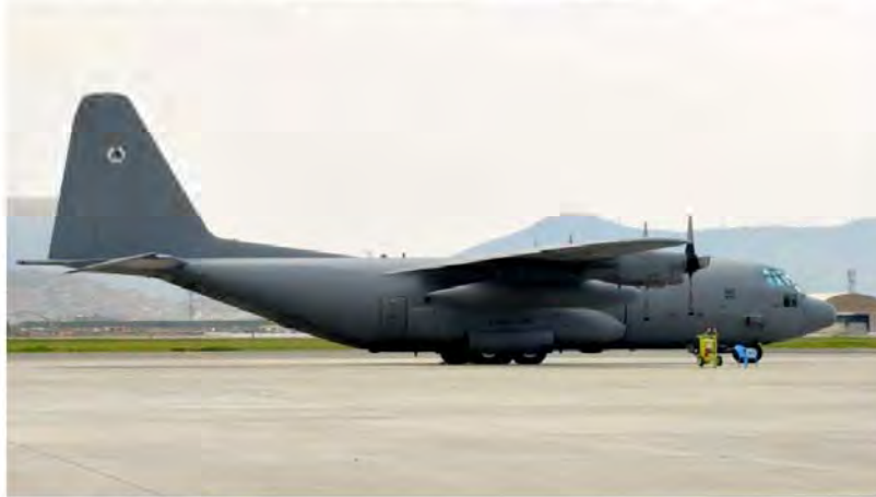
Photo 1 - AAF C-130 on the Flightline at the Kabul Air Wing—Kabul International Airport