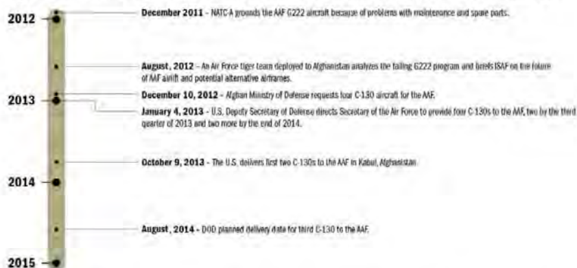
Figure 1 - Timeline of Significant Events in the Selection and Delivery of C-130s for the AAF