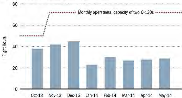
Figure 2 - Two AAF C-130 Flight Hours per Month